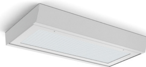
WARN Fluorescent Series