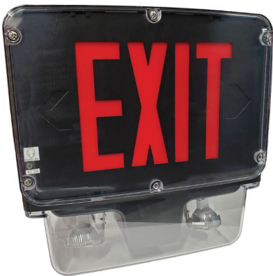
SCEXC Quick Ship Series