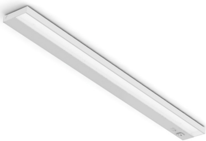
MUS Quick Ship Series