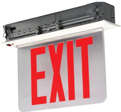
CCREL Quick Ship Series