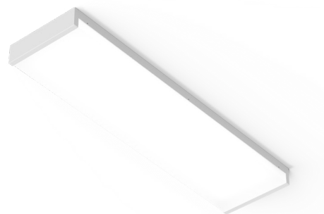
51HD Quick Ship Series

PROJECT: _____ TYPE: _____ PRODUCT: _____ APPROVED BY: _____